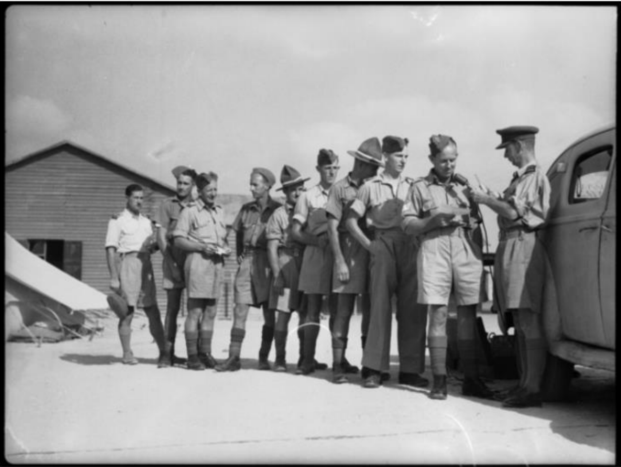
A queue of New Zealand soldiers waiting to broadcast home from the Broadcasting Unit at Maadi Camp in Egypt during World War II.