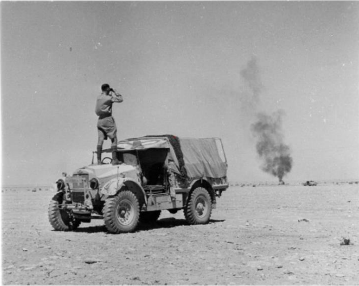
Arch Currie [sic. Curry] standing on a Morris truck at El Alamein, Egypt, looking through binoculars. Original caption reads: "NZ Div hold off enemy for whole day covering withdrawal of other troops to El Alamein. Shows one of our trucks burning." Photograph taken circa 9 July 1942. Ref: DA-06752-F