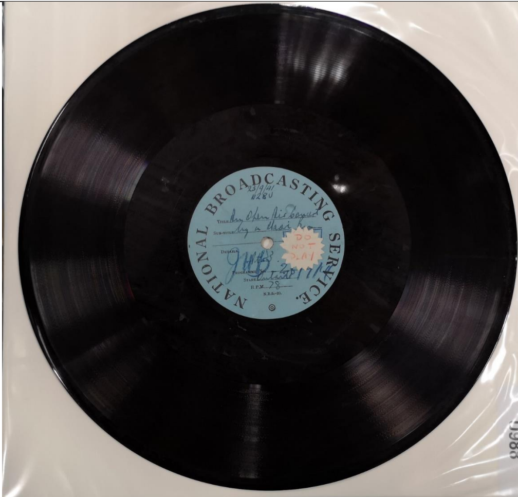
A typical U-series 12-inch, 78rpm acetate disc, after cleaning and digitisation. It features a National Broadcasting Service label, hand-written in fountain pen by Mobile Unit broadcasters. U988 is one of the discs used to record a concert by the Māori Battalion in Egypt in 1941