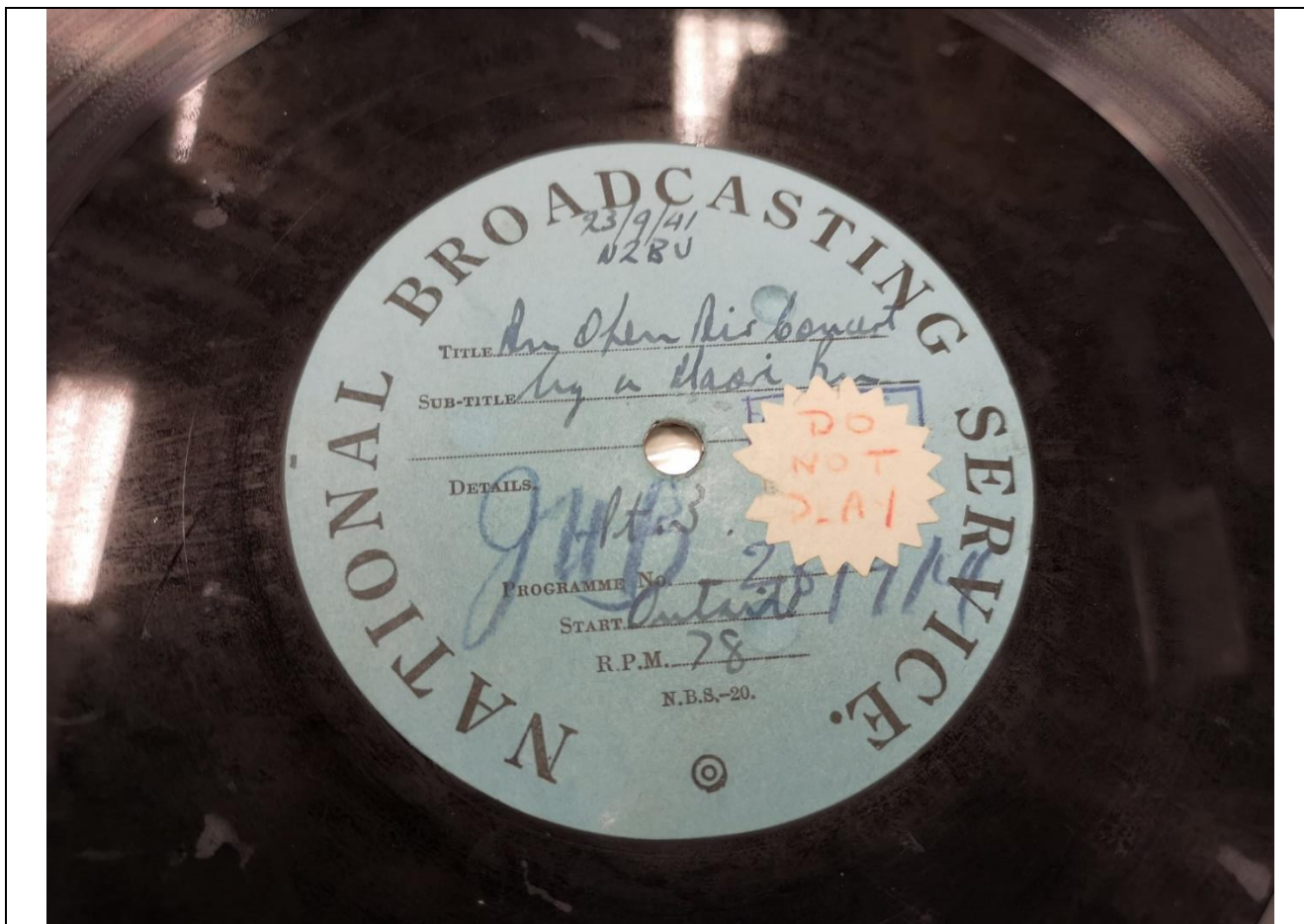
Detail of the disc label for U988: "23/9/1941 NZBU An Open-Air Concert by a Māori Battalion Pt. 3". Note the hand-made censor's label reading "Do Not Play". This part of the concert features a performance of the waiata "E pari rā" – a lament written by Paraire Tomoana for Māori soldiers killed in World War I. It was probably considered unsuitable for morale-boosting, war-time radio broadcasts.